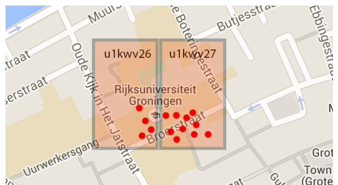
Figure 1: A border case in (de Kleer 2015)

All geo-tagged tweets from a month of Dutch Twitter data were used for training. This resulted in a total of 566.549 geo-tagged tweets. The geo-information was translated into a geoHash that denotes a specific area, and tweets with a similar geoHash and comparable timestamp were grouped and added to a list of event candidates. To handle the hard borders of the geohash area, candidates with matching timestamps in adjacent areas were then merged (Figure 1).