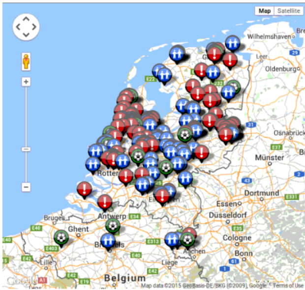
Figure 2: Visualisation of automatically classified events in The Netherlands, in April 2015 (de Kleer 2015).

to be most useful for this task were the most frequent words, the location using only the first five characters of the geo-Hash, the average word overlap between tweets in an event candidate and the average word overlap between different users in an event candidate.